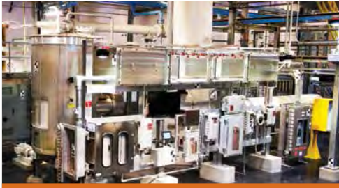
1. Petrochemical refinery