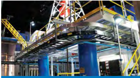
2. Upstream drilling & production rig

Overcurrent protection courses with reference to overcoming code related design issues, industry trends, improving system design and cost saving solutions.