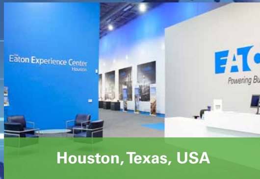
Houston, Texas, USA