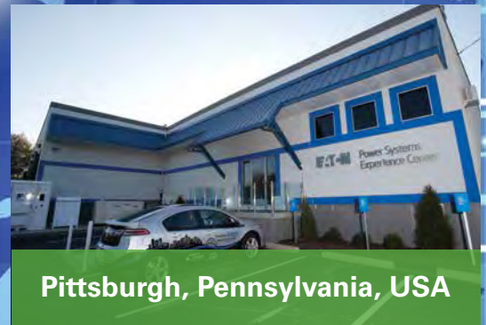
Pittsburgh, Pennsylvania, USA