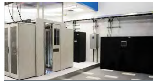
6. Data center

Stepping through electrical safety terminology and methodology and applying principles to any electrical system.