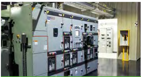
4. Power distribution