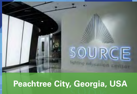
Peachtree City, Georgia, USA