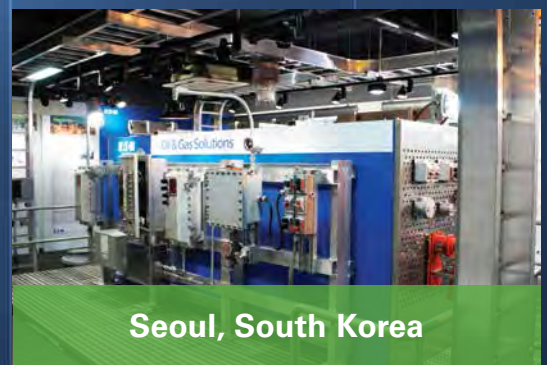
Seoul, South Korea