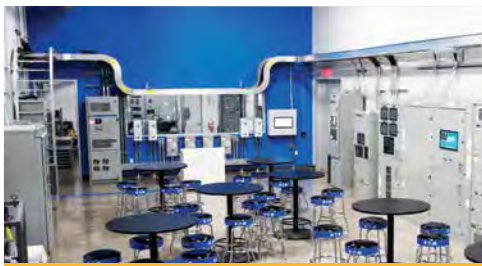
5. Power quality lab & motor room

Wide range of courses focused on understanding industry standards in relation to personal protection and safety.